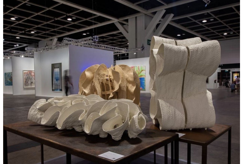
2022-20, 瓷土 Porcelain, H75×L46×W45cm, 2022

Treating the body as a creative tool, the artist devotes himself entirely to the field of ceramic art. He emphasizes the dialogue between the body and his artworks, and confronts the clay by integrating the subject with the body. His artworks are created on the basis of the interplay between the world and his perception as well as tactile and algesic senses within the clay-based structure. To create the purest and finest ceramic artworks, the artist not only adopted complex and painstaking procedures of production, but also exercised his superior skill in kilning. Through the constant process of deconstruction and reconstruction, he successfully transformed the heavy clay into delicate lines and shapes. His awe-inspiring, extraordinarily “large” but “thin” ceramic works, along with their charm of innovation, all resulted from such a refreshing contrast. Following his philosophy of life, that is, “transcending life through life, transcending artistic creation through artistic creation, and finally transcending life through artistic creation,” the artist keeps challenging himself, expecting to transcend the confines of life and artistic creation.