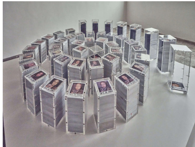
Norio Imai, Daily Portraits (1979 — ongoing)