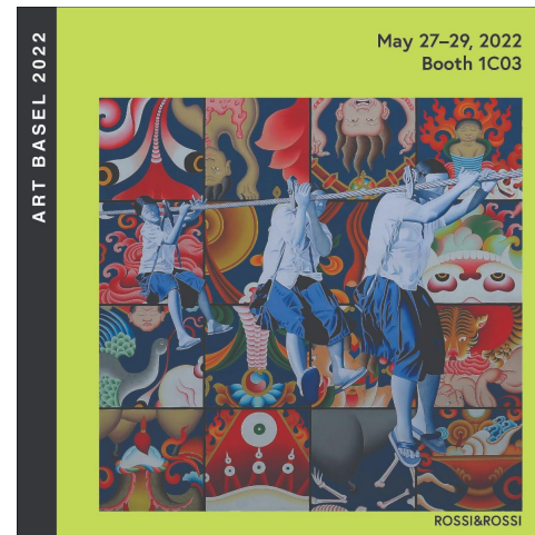
Tsherin Sherpa, Hang In There (detail), 2018, Acrylic and ink on cotton, 91.5 x 91.5 cm (36 x 36 in) each