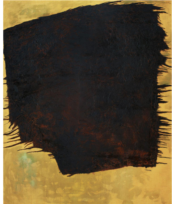
Yuki Katsura, Work, 1961