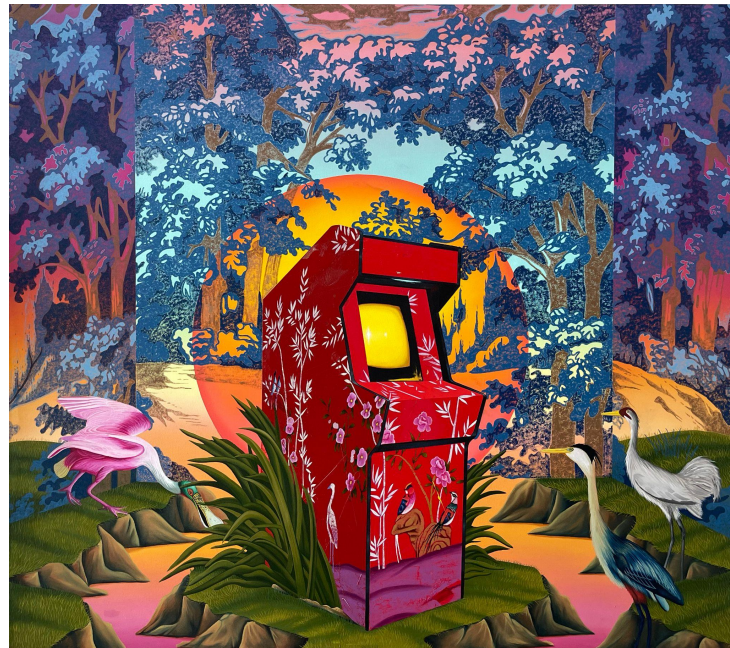
Stephen Thorpe, Imagination and Reverie, 2022, Oil on canvas, 180 x 158 cm