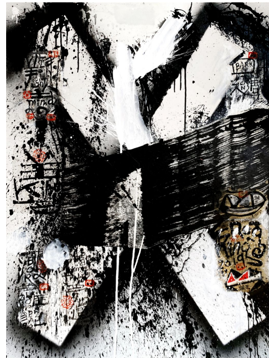
FROG KING Frog Xpression and Tears of Hope A, 2019