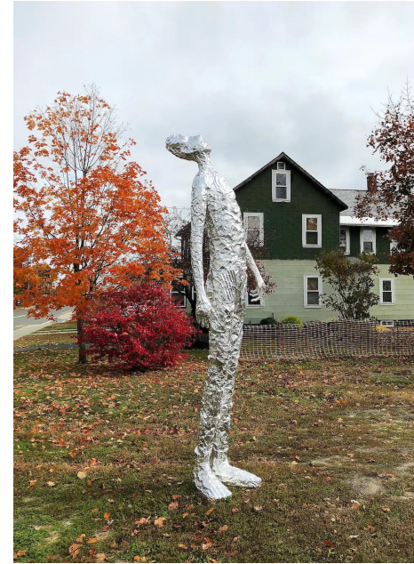
Tom Friedman, Looking Up (2020)