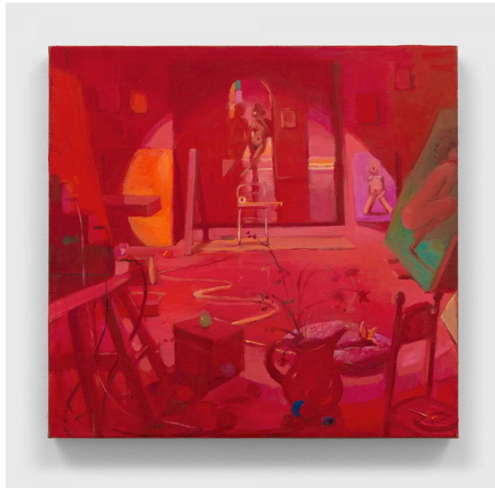
Lisa Yuskavage, 'Wee Pink Studio' (2021)