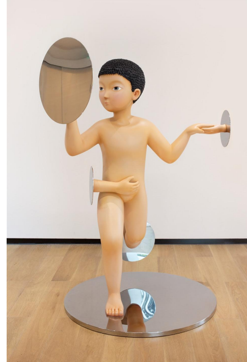
Gongkan, A Boy and Someone from Nowhere, fiberglass and stainless steel, 160 x 100 cm, 2021