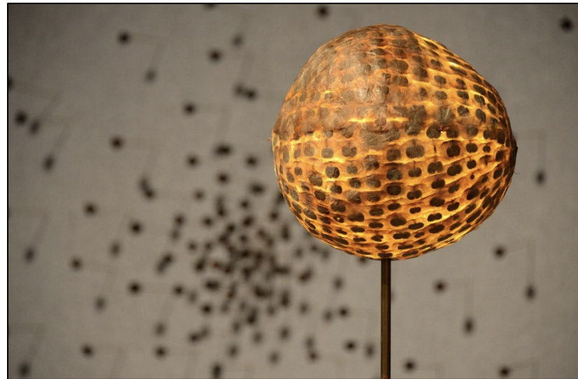
So Wing Po Seed of Damocles