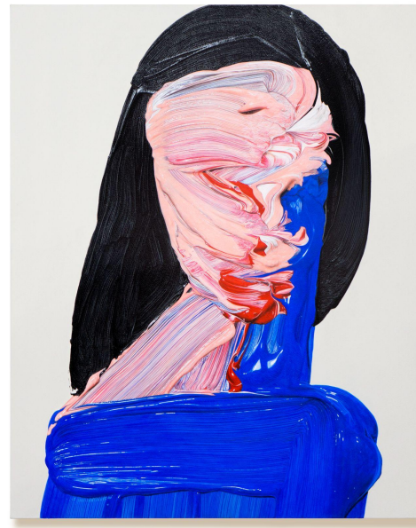
Teppei Takeda, Painting of Painting 033, 2020